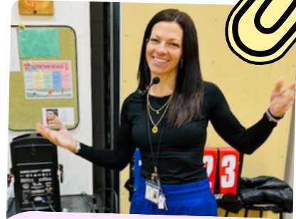
AFEE funded a wireless headset & speakers for Brookside PE classes

The Allendale Foundation for Educational Excellence ("AFEE") is the fundraising organization dedicated to raising money to support educational experiences at Hillside and Brookside schools.